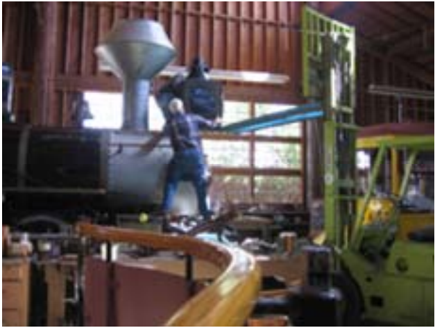
Installing Head Lamp

Moving Little Buttercup into the Trolley Barn spare)