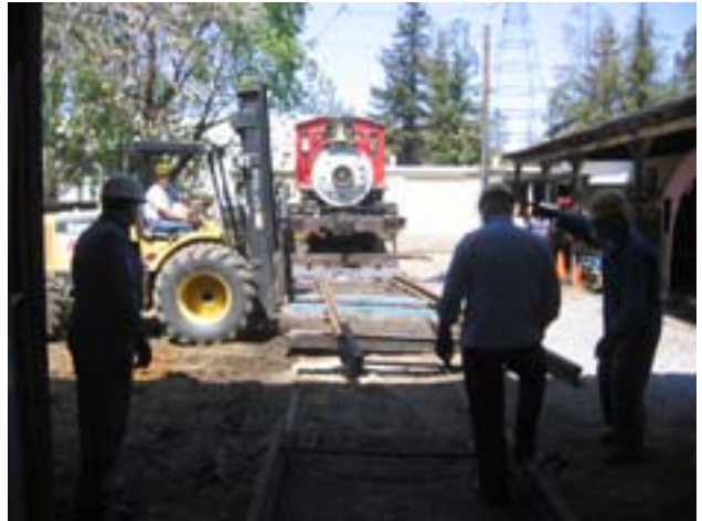
Putting temporary track in place