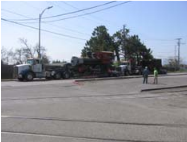
Little Buttercup Arrives