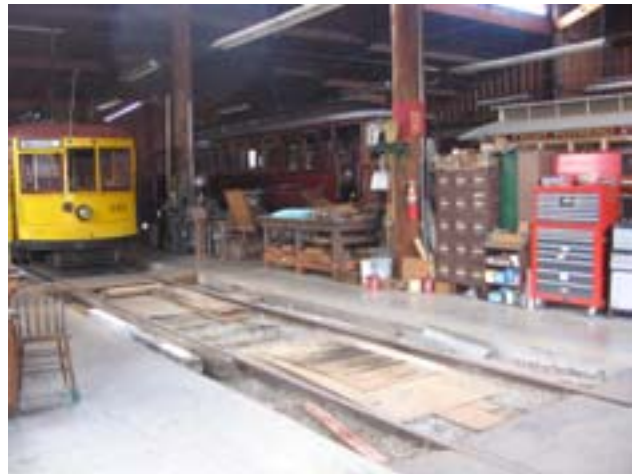
New home for Little Buttercup