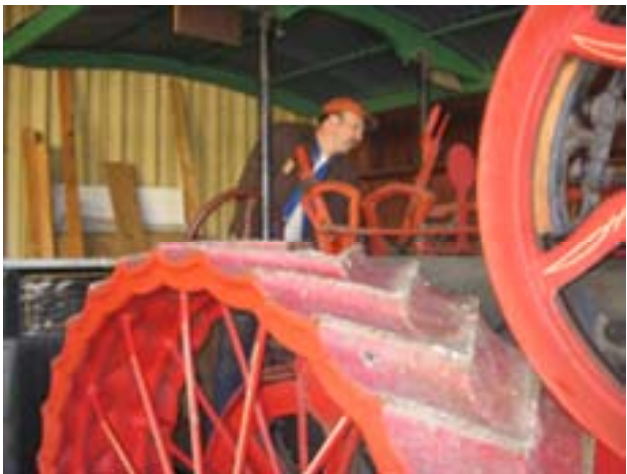
Moving the Port Huron out of the way