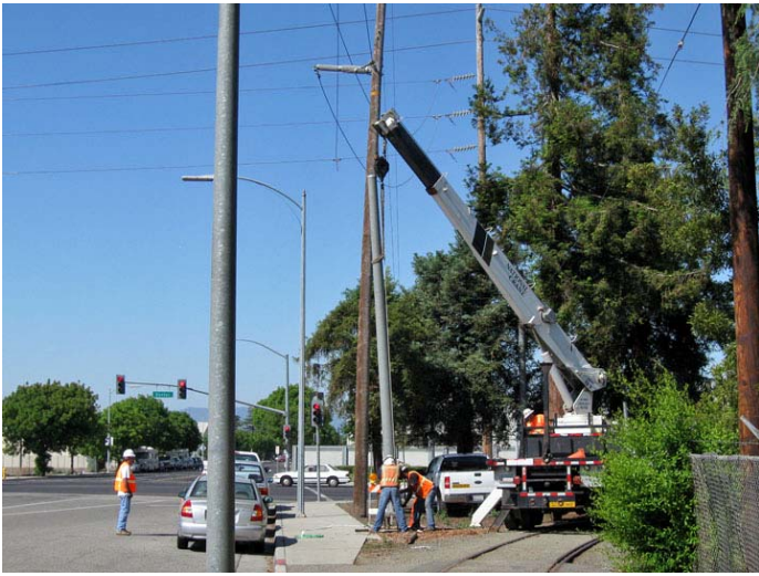
Installing the Last Pole