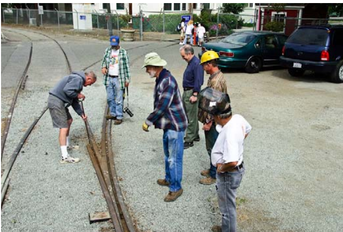
How Many CTRC Guys Does it Take?