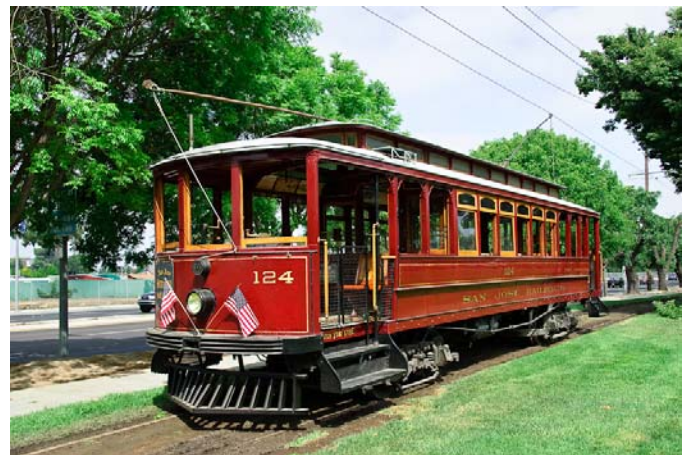
Car 124 on First Test Run