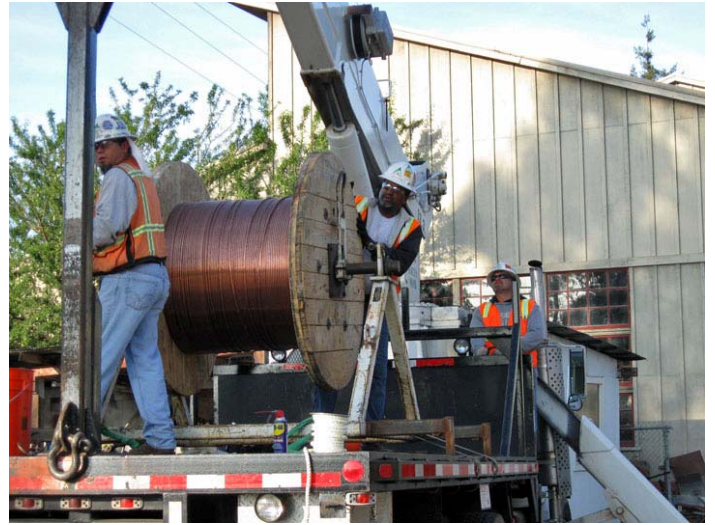
Mass Crew Loading Wire for Stringing