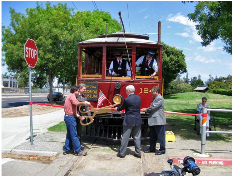
The "Un-cuttable" Ribbon