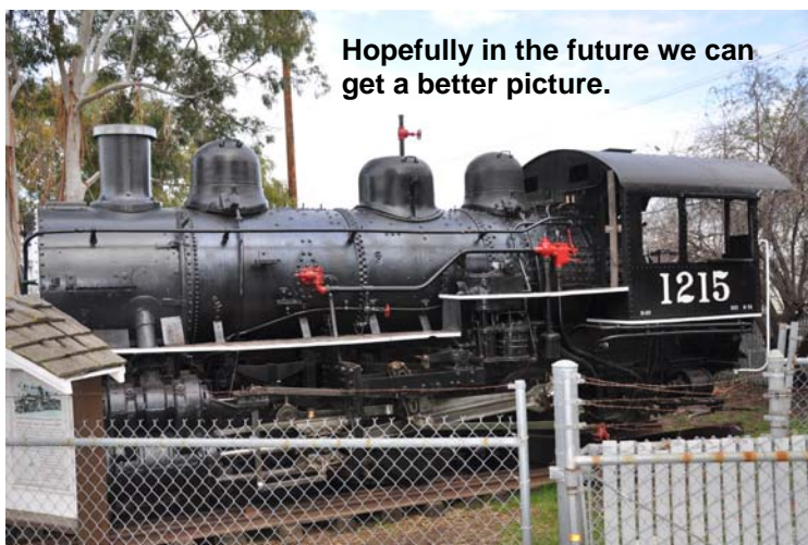
Hopefully in the future we can get a better picture.

Work continues to clean and paint lots of the little parts of the locomotive. The Murchison brothers are busy every week wire brushing and painting the parts along with the rest of the crew. Besides the new paint 1215 is now sporting new lettering on both the Locomotive and Tender. The floor on the firemen's side of the locomotive was basically non existence a new floor is being fabricated and installed. The new floor will support the air tank that hangs under the cab on the firemen's side. Along with the many parts which have been put back on the locomotive.