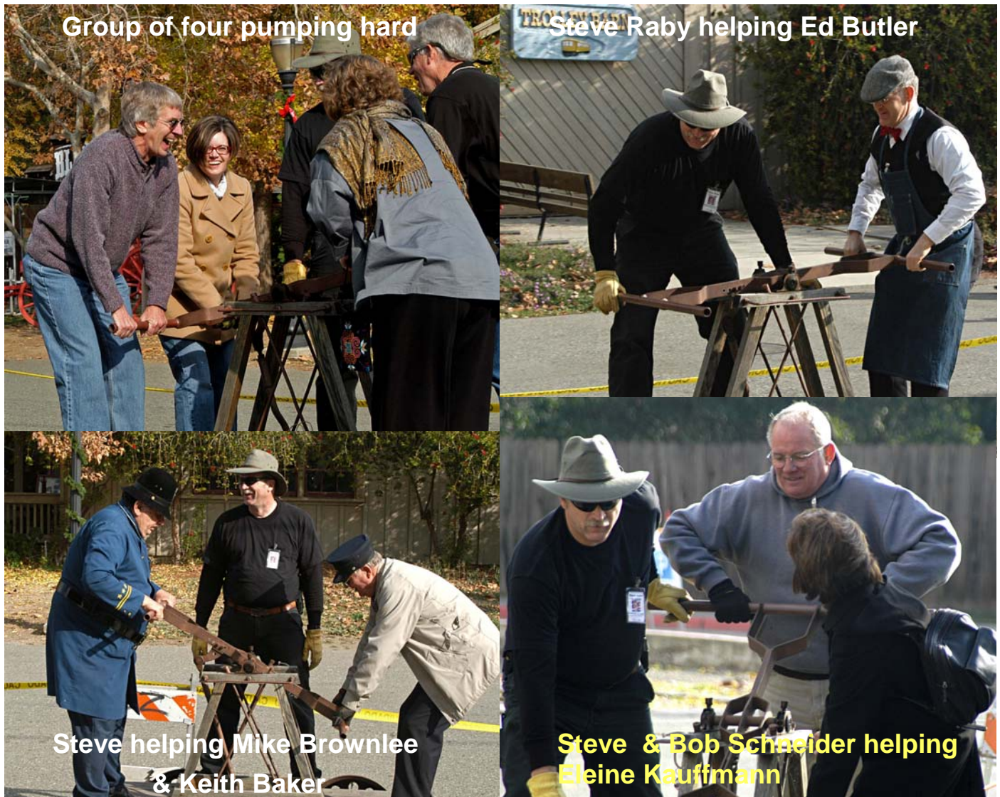
Group of four pumping hard