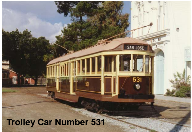
Trolley Car Number 531