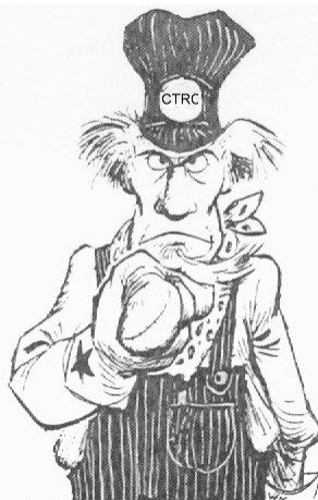
CTRCC WANTS YOU