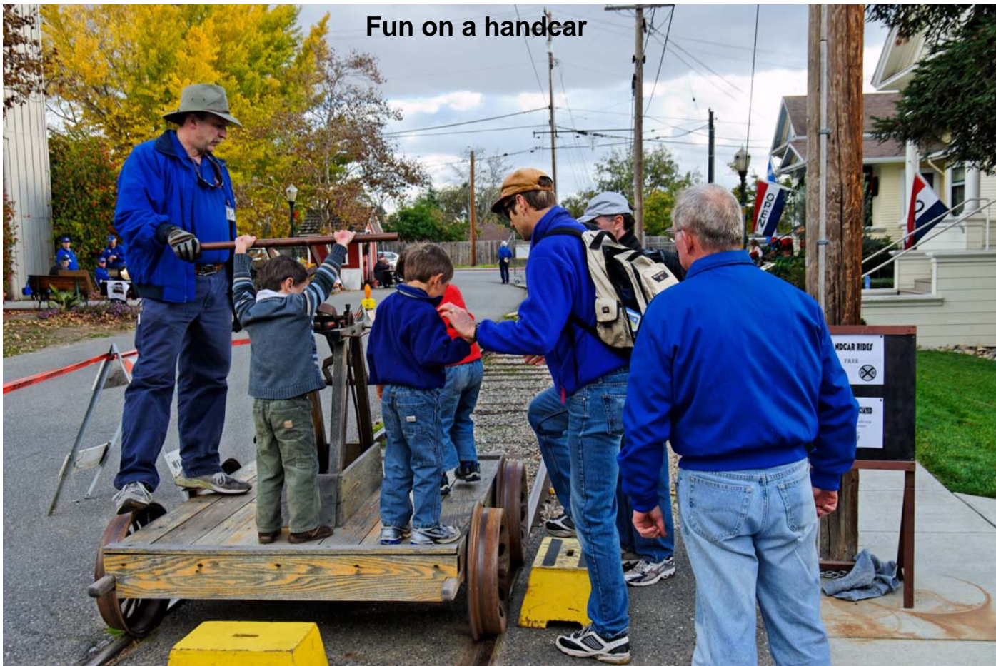
Fun on a handcar